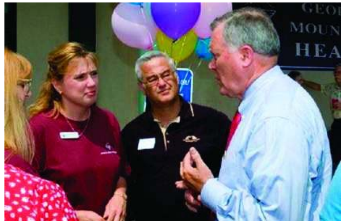
On the left, Congressman Nathan Deal (D-GA) talks with Health Center leaders and patients at Georgia Mountain Health Services in Morganton, GA.