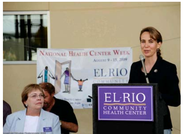
Congresswoman Gabrielle Giffords celebrates National Health Center Week 2009 at El Rio Health Center, Tucson, Arizona