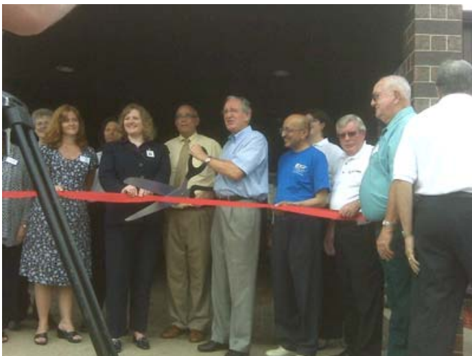
On the left, Senator Tom Harkin cuts the ribbon at Linn Community Health Center, Cedar Rapids, Iowa

For more information check out www.healthcenterweek.org