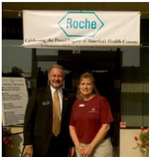
Roche Pharmaceuticals thanks health centers for all of their hard work by sponsoring the Health Center Week event at Georgia Mountain Health Services.