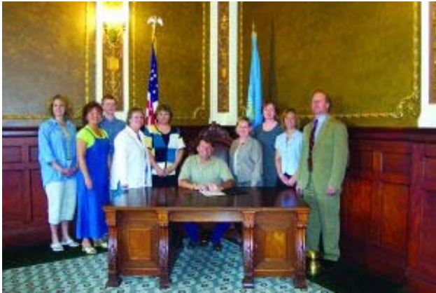
On the right, Governor Mike Rounds (R-SD) signs a State Proclamation recognizing Community Health Center Week with health center leaders and Board Members.